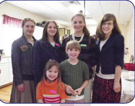
The Bates and Gagnon girls.