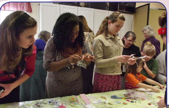
There were plenty of bookmark backgrounds, decorations, and embellishments to choose from!