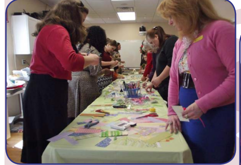
After lunch the ladies enjoyed a time of fellowship while making bookmarks